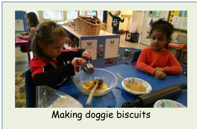
Making doggie biscuits

Hi there Butterfly families and happy spring!!! What a beautiful time of the year it is and the weather is just perfect! We hope that you have all had a wonderful winter and are ready for all of the beauty the spring has to offer!