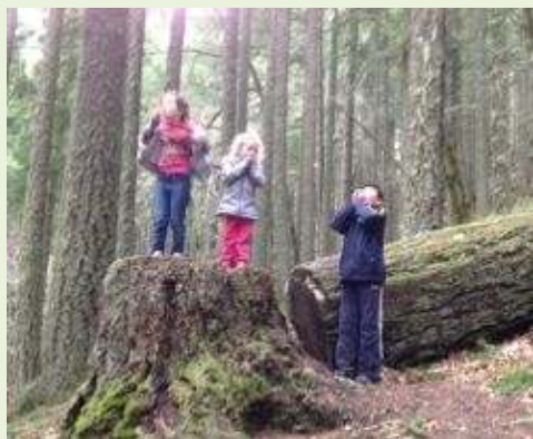
Calling for Big Foot in the woods

Students have been busy building forts during choice time and pushing their imaginations and creativity. Trivia has also been popular. We cover math, geography, biology, and even history! The Otters also enjoy spending time with Jellybean and Brownie (the guinea pigs). While the students engage with the guinea